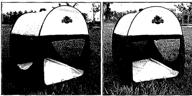
click to view zoomed image