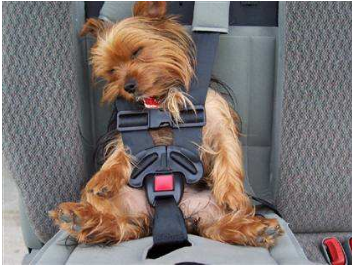
It's been a hard day!!!