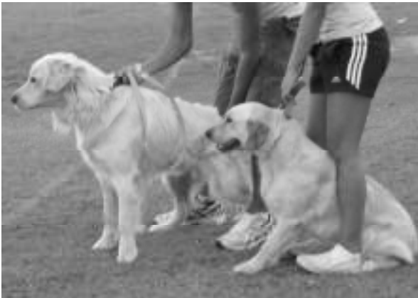
Beginners raring to go. PAGE 10